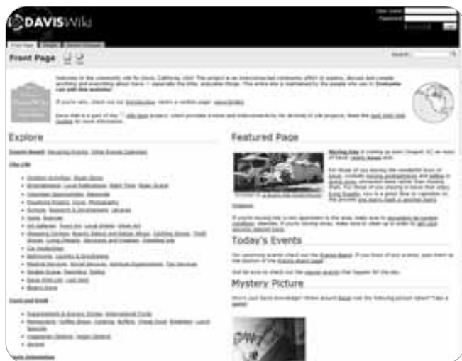
The Davis, Calif., wiki homepage shows lots of links, images, a list of “Today’s Events,” and fun mystery photos, inviting users to identify the pictured location in their community.

Oh, and about the Afghan wiki that originally piqued my interest in this topic? It’s restricted—for military use only.