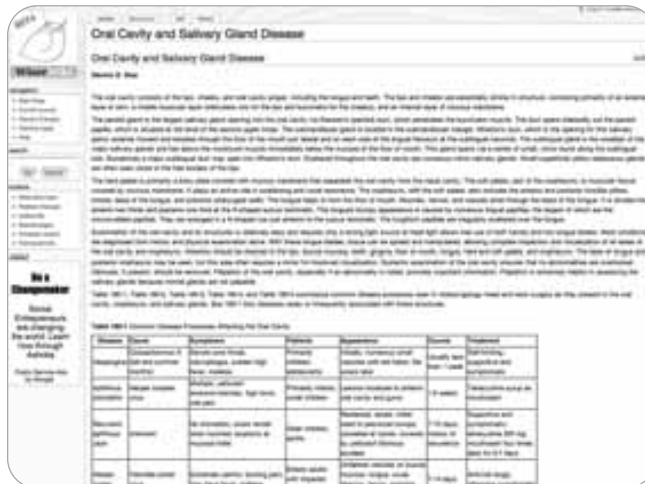
WiserWiki is based on a core of previously published information from Elsevier’s Textbook of Primary Care Medicine.

Next in this group is a site called WiserWiki ( http://wiserwiki.com ), subtitled Evidence-Based Medical Information and created by Elsevier. Like NutritionPedia, WiserWiki is based on a core of previously published information; in this case, The Textbook of Primary Care Medicine (third edition, 2001), “one of Elsevier’s best-selling medical textbooks” as noted by a PR Newswire report of Jan. 29, 2008. Unlike NutritionPedia, here only a select group of “anyones” is allowed to edit the wiki. As explained on the homepage, “WiserWiki can only be edited by board certified doctors to ensure that the information is as trustworthy and reliable as possible. Doctors can also use WiserWiki as a valuable resource to collaborate with each other and to determine best practices by group consensus.”