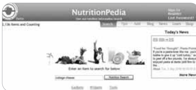
NutritionPedia.com, a database of Nutrition Facts Labels, is a commercial site.

NutritionPedia.com is, basically, a database of Nutrition Facts Labels, distinguished by its size (more than 72,000 items) and breadth of material. It is a commercial site, very elegant in appearance, without the accustomed wiki “look and feel”; indeed, it’s not clear where outside users can chime in, if at all (there is a blog, but the latest topic was posted by NutritionPedia in February 2008, and there don’t appear to be any comments or discussion). It offers “Gadgets,” “Widgets,” and “Tools” for adding a NutritionPedia search box to your Google homepage or a tip of the day to your Facebook page. Additionally, there’s a daily news item that you can get as an RSS feed. NutritionPedia also offers essays on dieting and wellness topics (the “Learn” section), very much in layman’s language, that are useful to read (the one